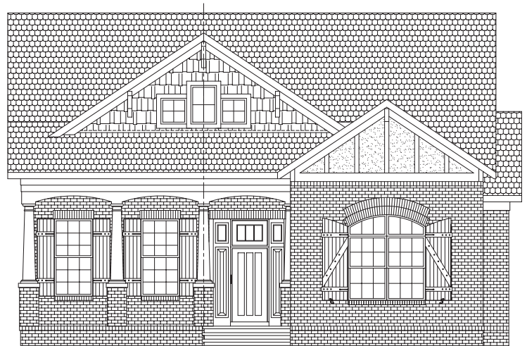
Front Elevation "P"