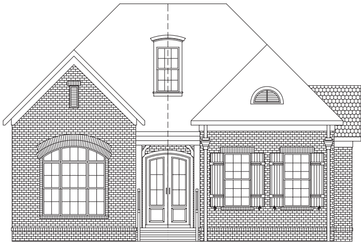
Front Elevation "N"