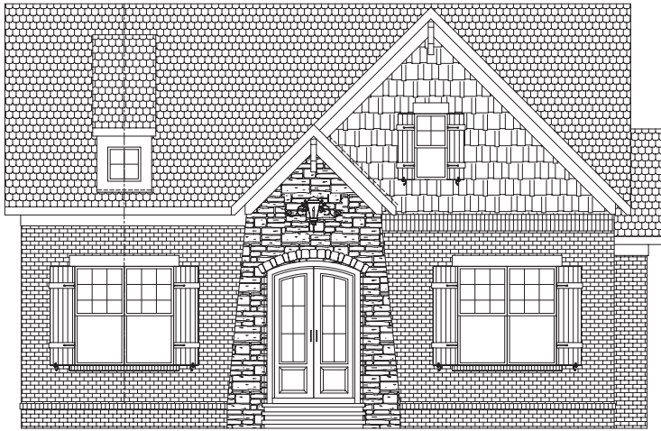
Front Elevation "C"