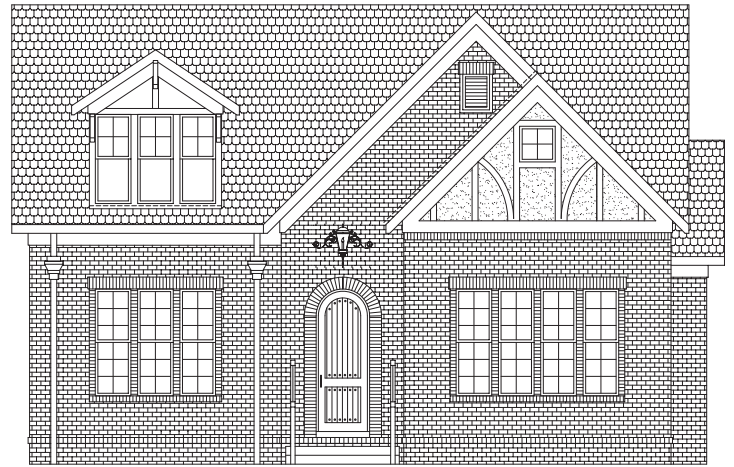
Front Elevation "I"